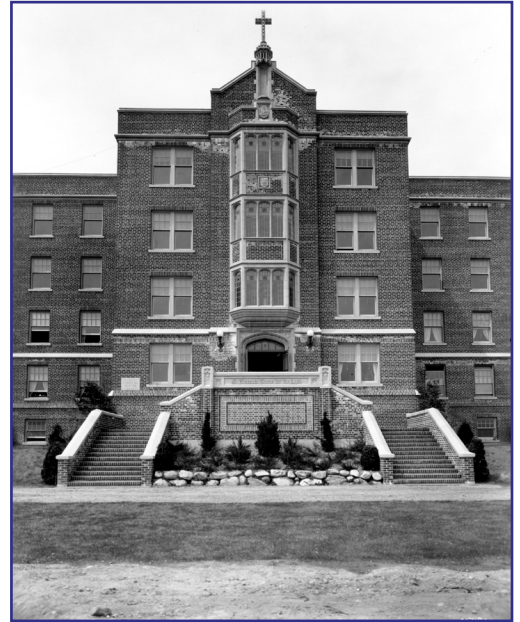
Entrance to what was then known as "St. Vincent's Home for the Aged," just after completion in 1924. Providence Mount St. Vincent, Seattle, Wash.

§Little Company of Mary Health Facilities in California