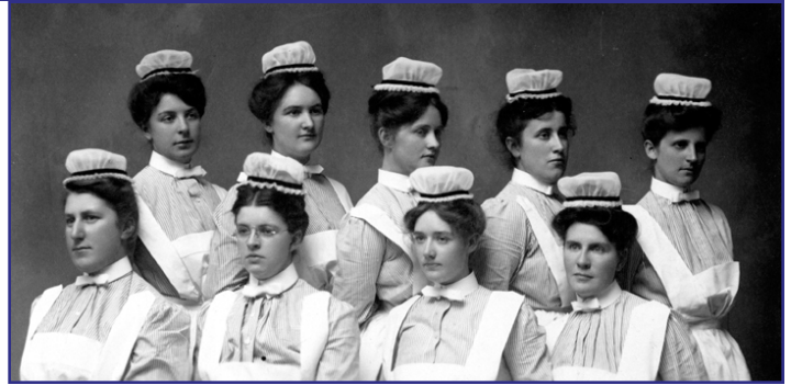
School of Nursing class of 1905, Providence St. Vincent Medical Center, Portland. (Image #53.E12.50)

The post-war years had a huge impact on nursing education. New nursing and treatment skills, changed convalescent practice, increase of practical nurses and aides, increased respect for and autonomy of nurses, and the pursuit of college degrees through the GI Bill all contributed to the changing face of nursing, nursing education and a shift from hospital-