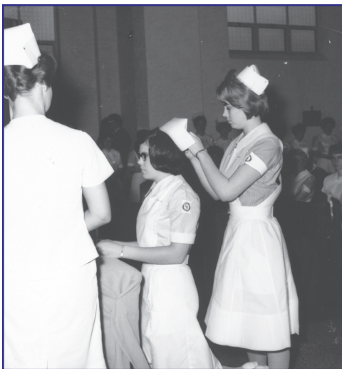
Capping ceremony at Columbus School of Nursing, Great Falls, Mont., 1966. (Image #84.E3.4) Inset: Nursing pins from Providence, Seattle (through Seattle College) and St. Vincent Hospital, Portland.

The committee left it up to the individual schools to use