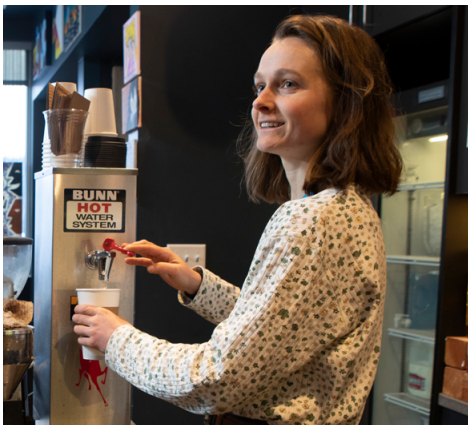
A resident makes coffee at Covenant House Alaska. The Bridge to Success program helps young people take the next step toward independence.